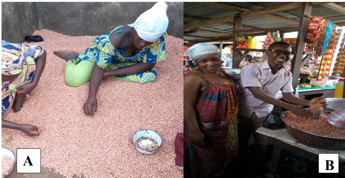
A: Sorting by market women, B: Groundnut sampling in the market