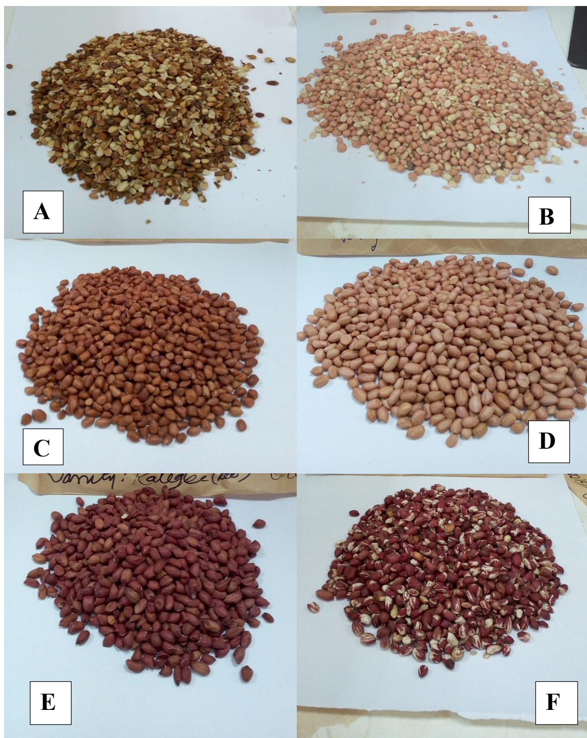
A: Dawadawa, B: Broken-China, C: Old-China, D: New-China, E: Nkatepa, F: Agric